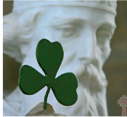
Celebrating Saint Patrick